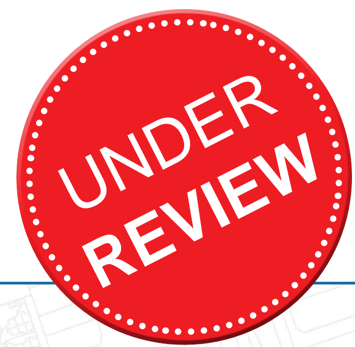
Zoning and precinct plan

The Northshore Hamilton PDA consists of ten precincts. Land within the PDA is also allocated a zone that indicates the type of land uses expected in these areas.