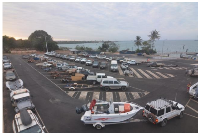
Evans Landing Boat Ramp Car Park well used during the 2017 Weipa Fishing Classic

* Funding amounts referenced are as approved.