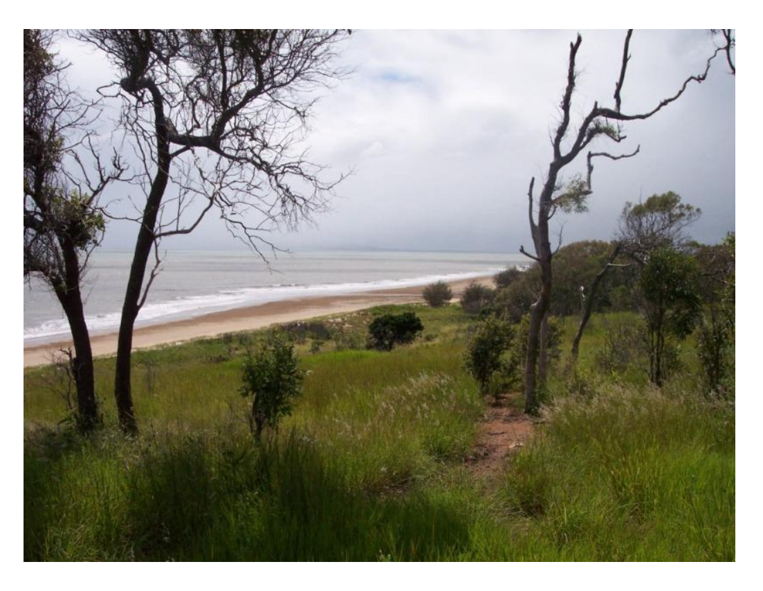
Figure 1: View from Headland

The project offers a unique opportunity to develop a tourism-based community on a very special part of the Queensland coast. First and foremost, the proposed development will provide the strategically important industrial centre of Gladstone and mining areas of Central Queensland with a quality tourist and recreational facility that is not currently available in the region. The island's natural attractions will be augmented by recreational facilities for activities such as swimming, boating, fishing, camping, picnicking, bushwalking, bowling, tennis, golfing and flying.