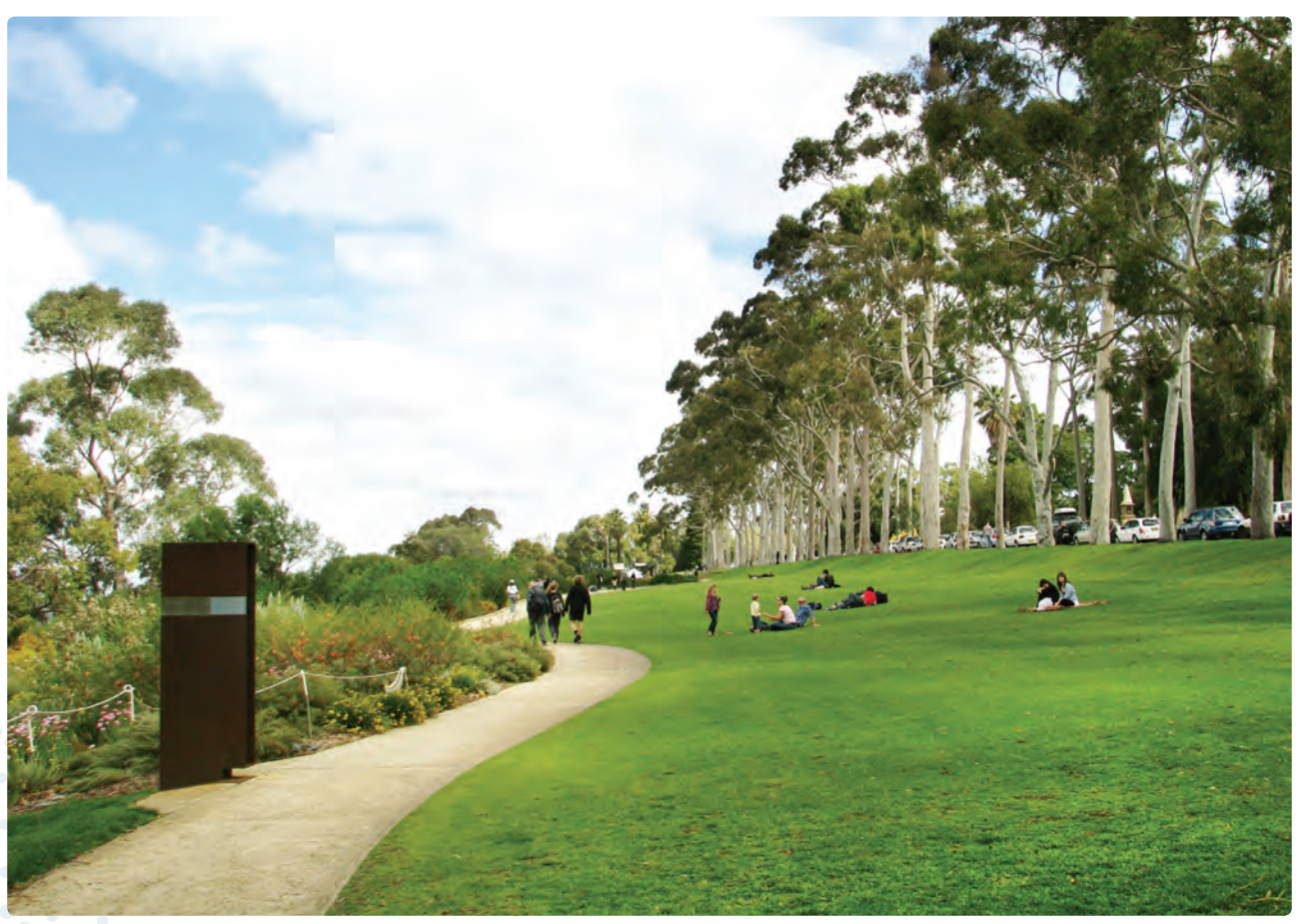
Major recreation park - large area for multiple activities