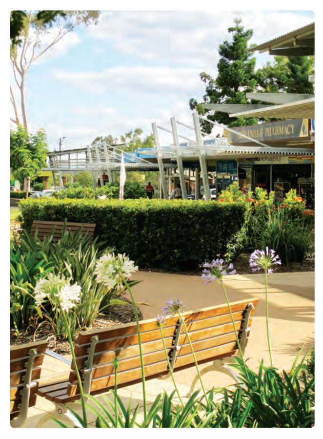
Civic park - landscape and amenity for residents, workers and visitors to a centre

The MEDQs objective for parks is to achieve a network of diverse, accessible, high quality parks and recreation facilities that are sustainable, contribute to the attractiveness and vitality of communities, and enhance people's health and wellbeing by meeting their needs for outdoor recreation in urban settings now and into the future.