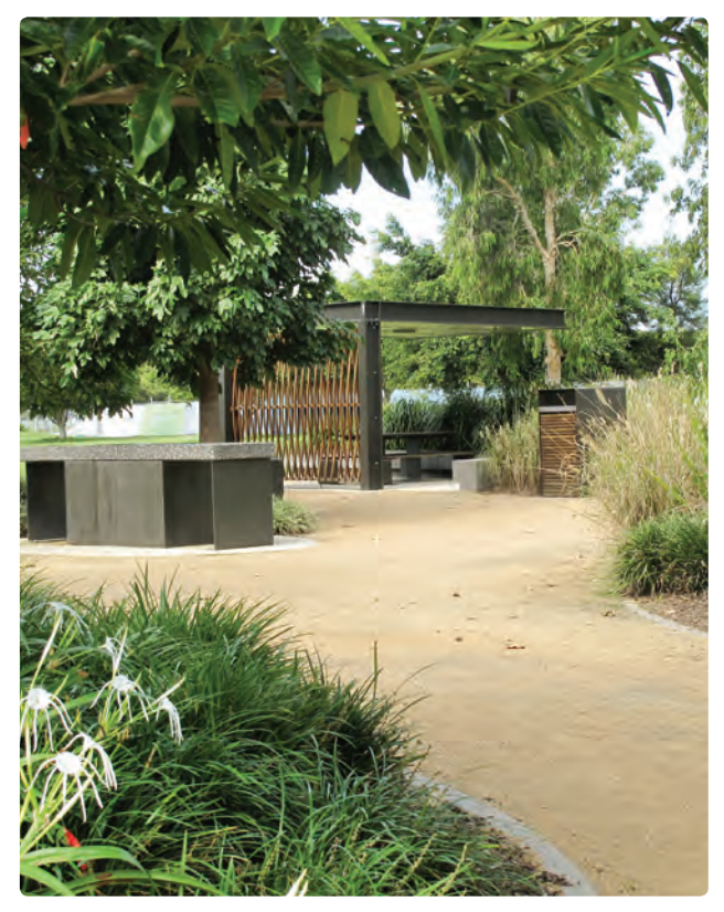
Local recreation park - visual amenity and passive recreation

Where a park is to be located adjacent to an existing watercourse a study of the watercourse geomorphology maybe required for the area immediately adjoining the proposed park and an area upstream and downstream of the site sufficient to determine the stability of the watercourse and its surrounds. The study shall also propose what site works are required to ensure the stability of the watercourse and therefore safeguard park embellishments. The study shall be undertaken by a suitable qualified geomorphologist.