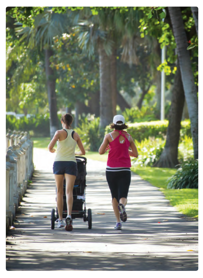
District recreation park - for active and passive recreational needs

These densities are significantly higher than achieved in traditional neighbourhoods, and parks play an important role in contributing visual relief and interest to residential communities as well as meeting recreational needs.