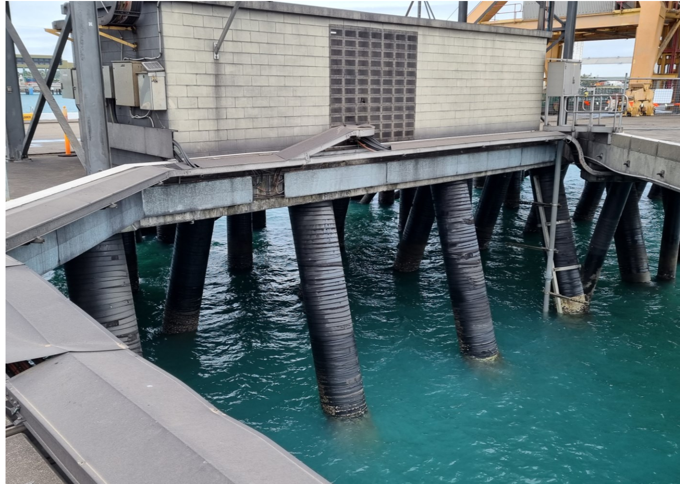
Consumer mains cable ladder behind the switchboard room.