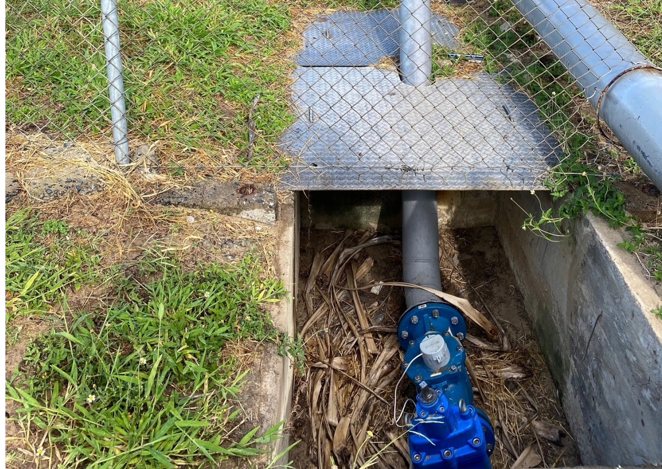
Typical site requiring the installation of a backflow prevention device (after the water meter).