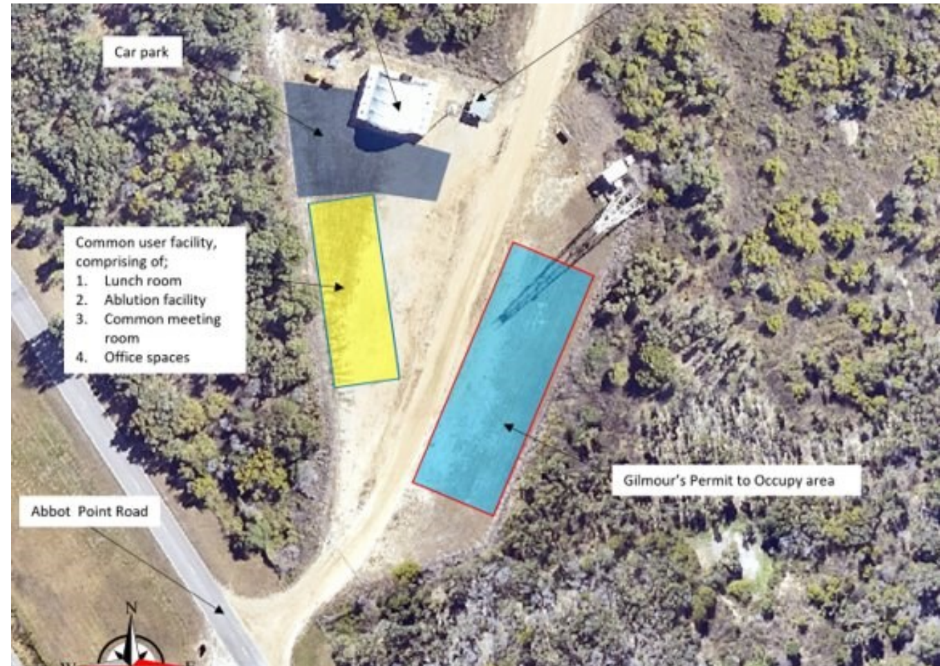
Concept design of the common user facility at Port of Abbot Point.