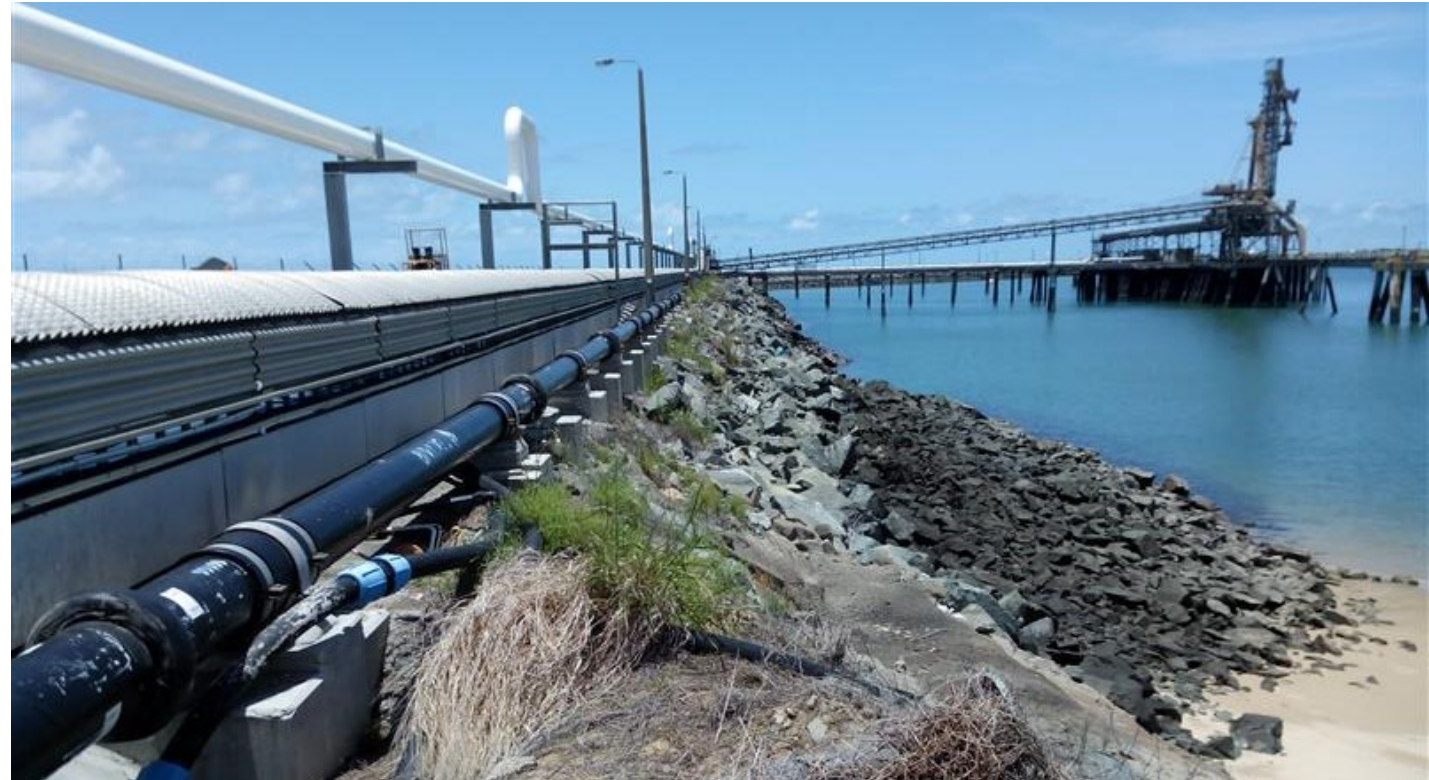
View from shoreline looking at the Wharf 5 Western Approach.