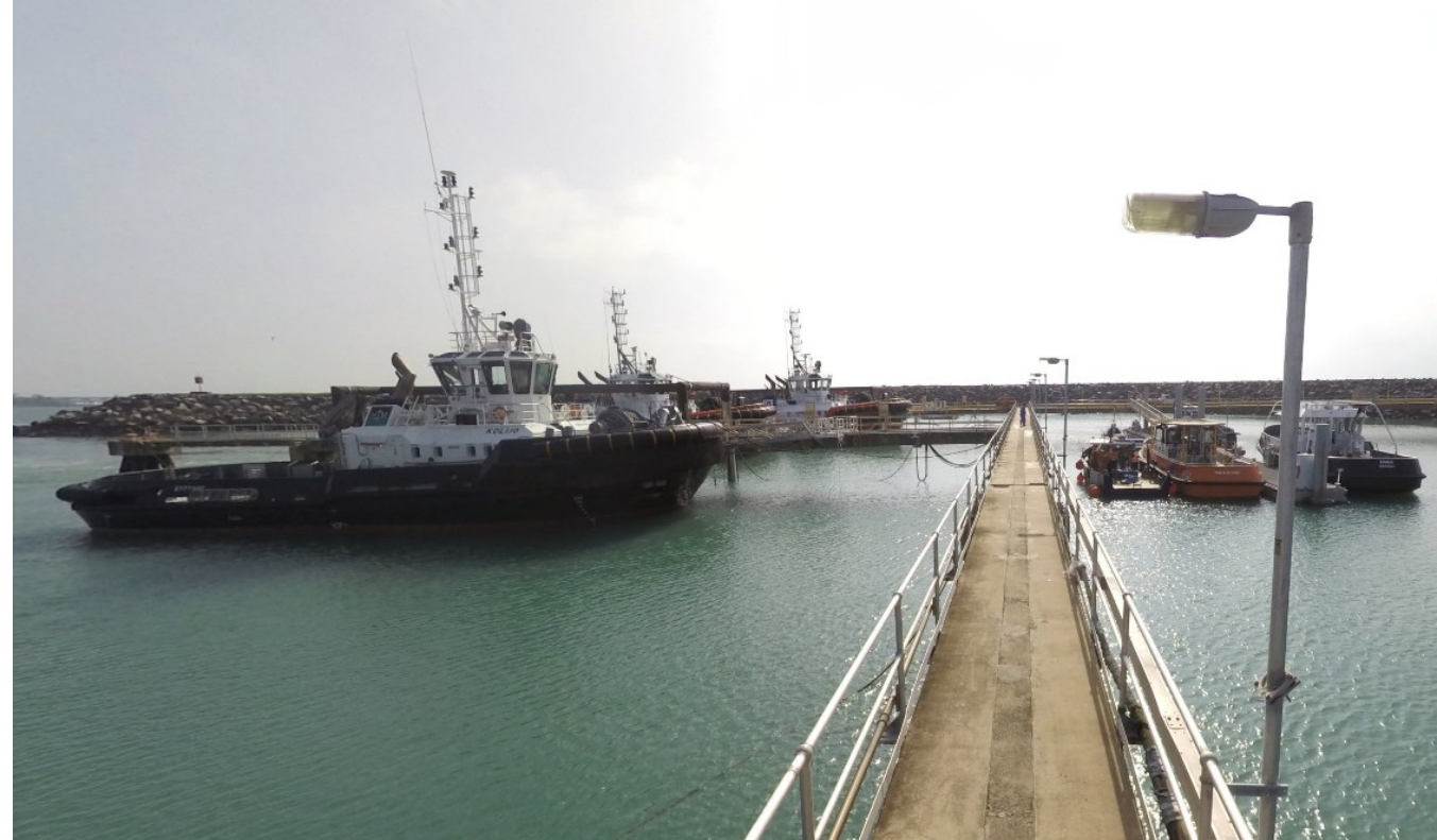
Half Tide Tug Harbour Berths 1 – 3 (left) and line boats (right).