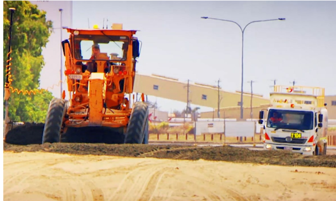
Asphalting underway at the Port of Mackay (Gudyara Road).