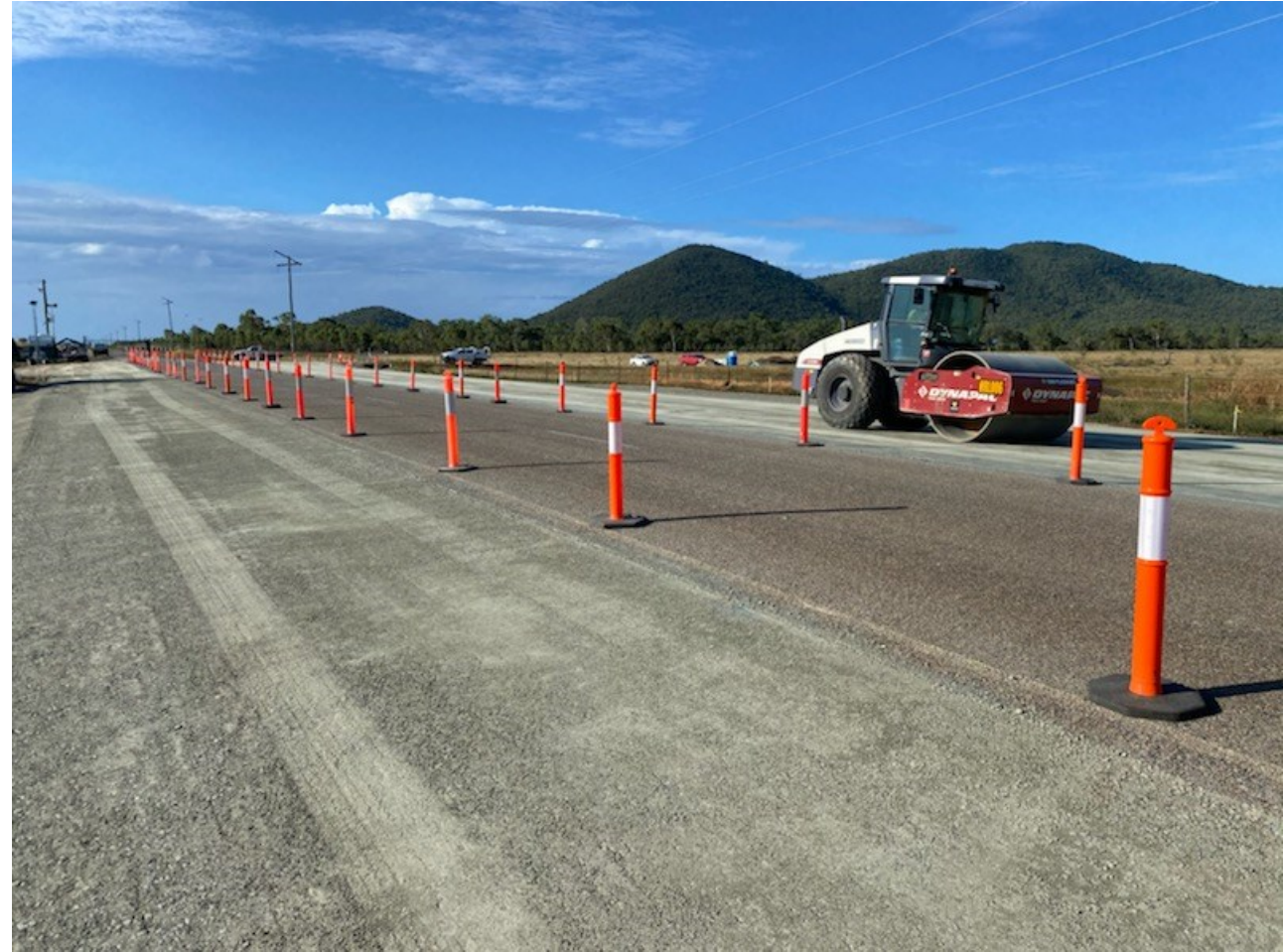
Previous works – Abbot Point Road.