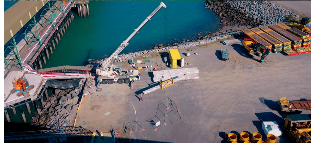
Examples of recent locally procured projects at the Port of Mackay