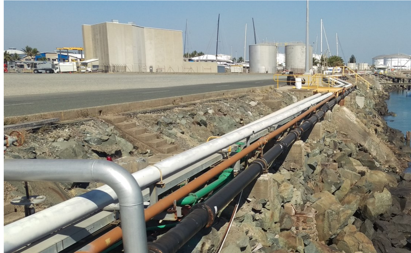
Existing alignment of fuel lines and services.