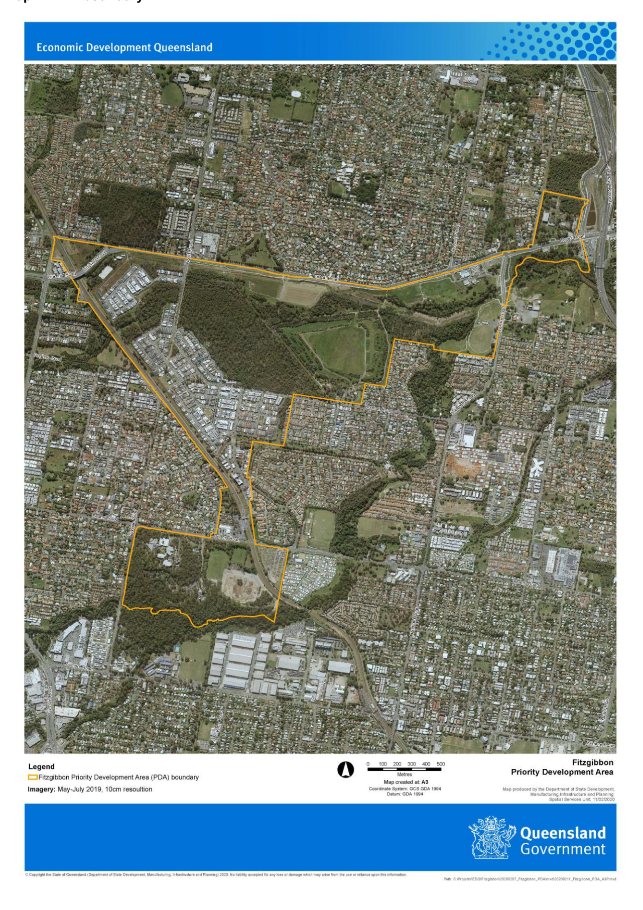
Map 1: PDA boundary