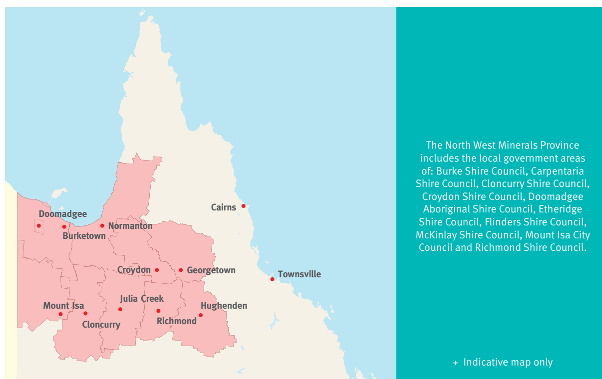
Figure 1: A Strategic Blueprint for Queensland's North West Minerals Province geographic area

A Strategic Blueprint for Queensland's North West Minerals Province and the North West Queensland Economic Diversification Strategy (NWQEDS) established the Queensland Government's partnership with local governments, communities and industry to build the region's economic diversity and create opportunities for North West Queensland communities ( Figure 1 ). Through these strategies, the partnership has facilitated approximately $2.3 billion in investment and 1700 jobs, laying the foundation for future development to enhance prosperity in these important regional communities.