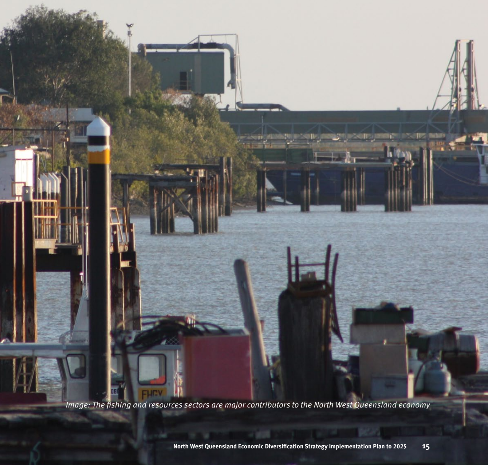
Image: The fishing and resources sectors are major contributors to the North West Queensland economy