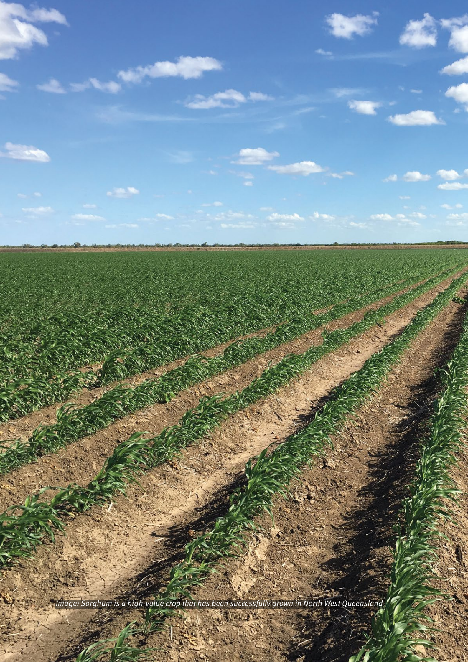
Image: Sorghum is a high-value crop that has been successfully grown in North West Queensland