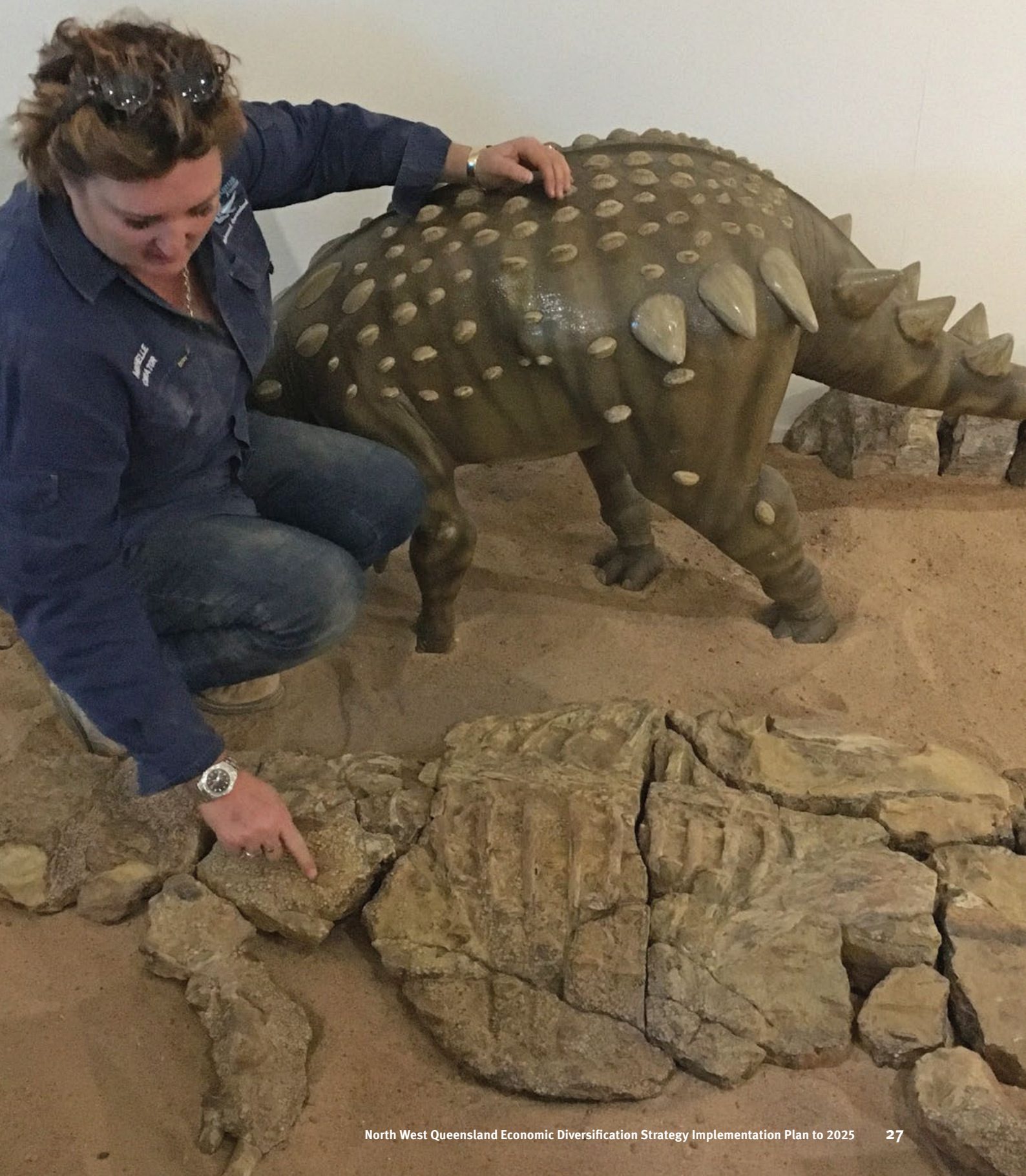
Image: Dinosaur-tourism is attracting a new wave of visitors to North West Queensland