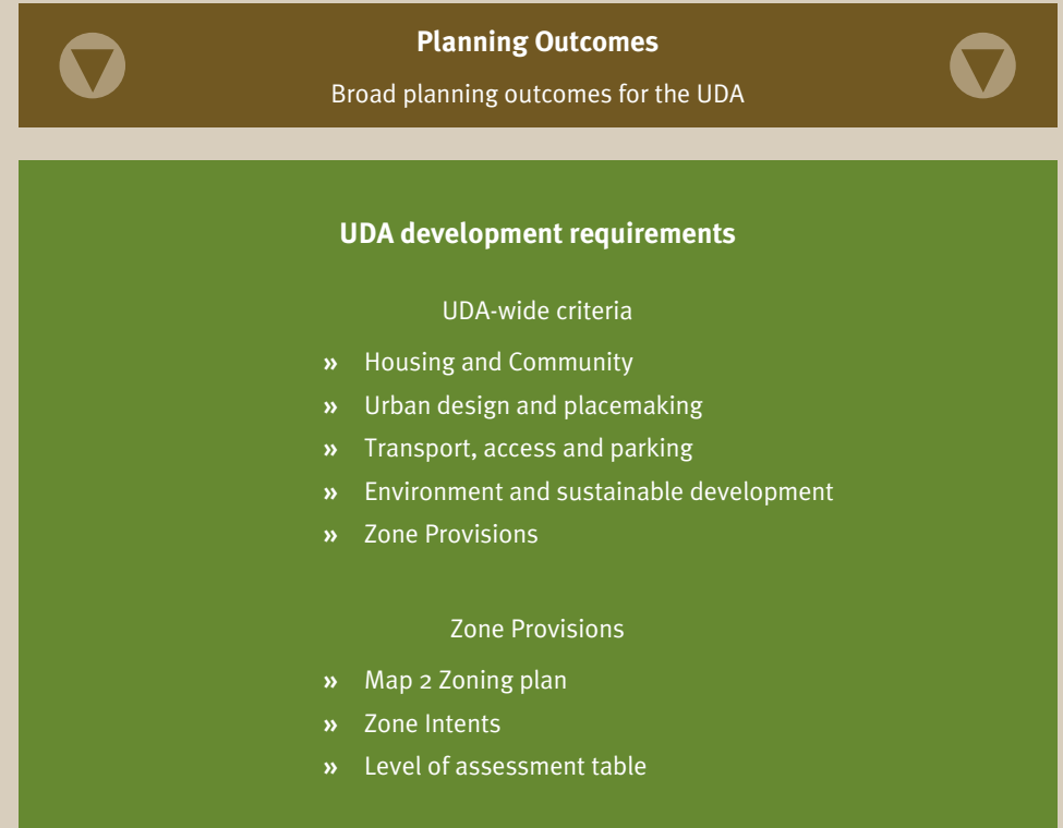
Figure 1: Components of the land use plan and their relationship