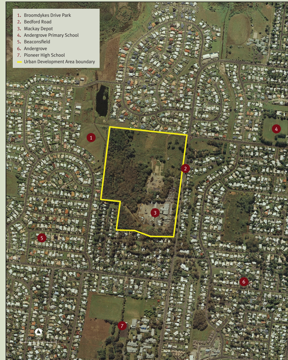
Map 1: Andergrove Urban Development Area Boundary

The Andergrove UDA is a greenfield site comprising Council owned land. The UDA is in close proximity to open space and schools, is well serviced by local amenities and is bordered by existing residential areas.