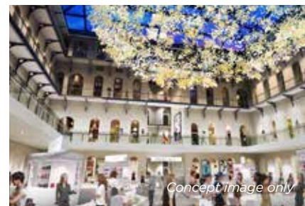
Concept image only