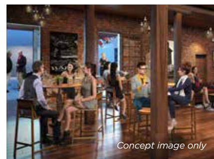
Concept image only

By sensitively revitalising these 'jewels' of the precinct, locals and visitors alike will have the unique chance to explore both the Aboriginal and European history of Brisbane through a variety of food and beverage, tourism, and retail experiences, which will breathe new life into a largely underutilised part of the city. New heritage trails through the precinct are also proposed to incorporate both Aboriginal and European history as part of the integrated resort development.