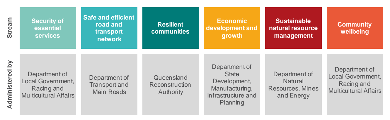
Figure 3 – Administration Agency for each program stream

The Administration Agency for each stream is as follows: