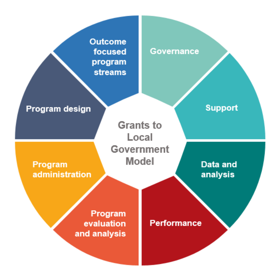
Figure 1 – Grants to Local Government Model and its components

The Model is made up of eight components as outlined in Figure 1 below: