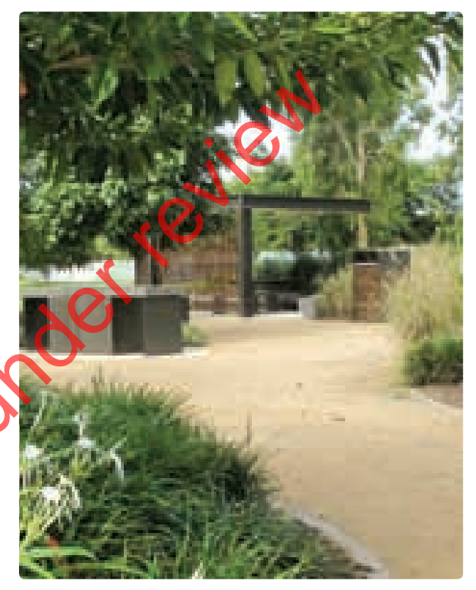
Local recreation park - visual amenity and passive recreation