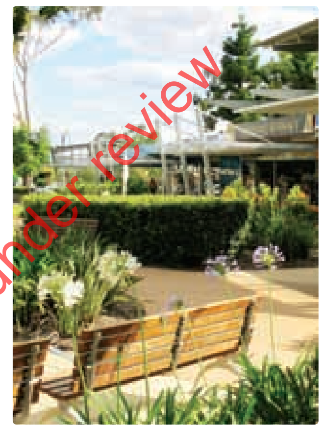
Civic park - landscape and amenity for residents, workers and visitors to a centre