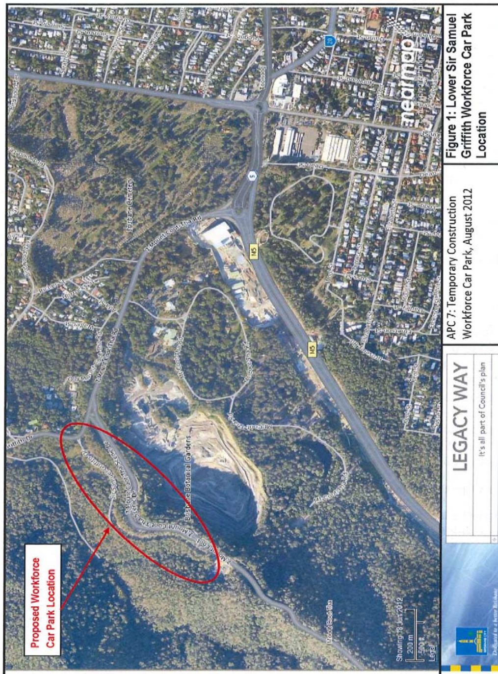
Figure 1 Lower Sir Samuel Griffith Workforce car park location