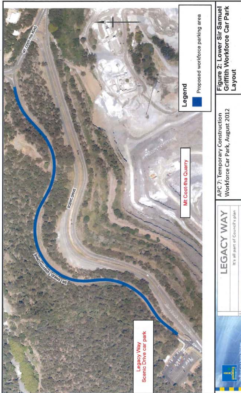
Figure 2 Lower Sir Samuel Griffith Drive Workforce Car Park Layout