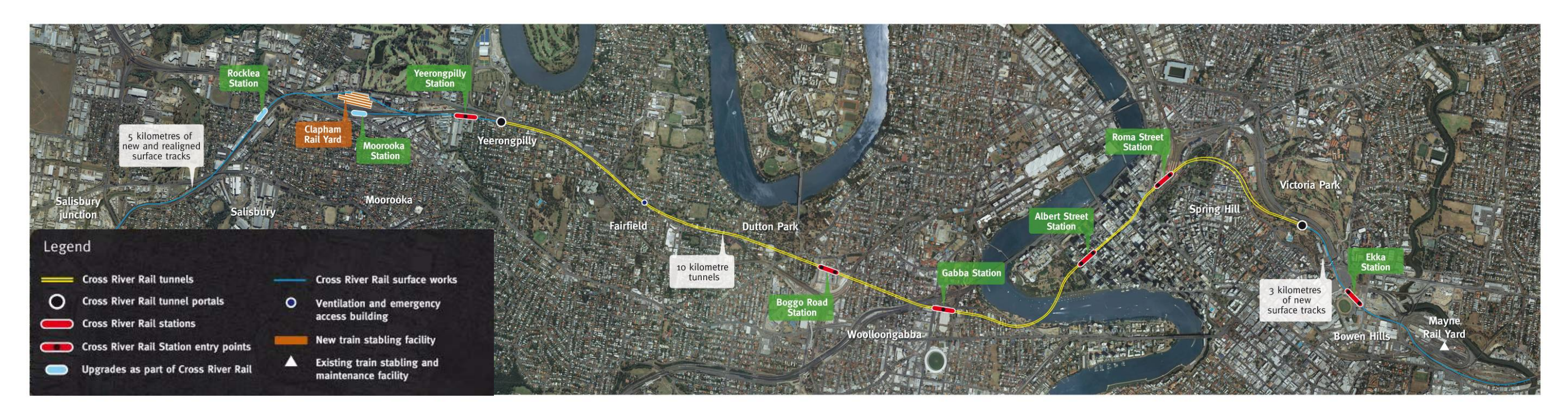
Figure 2.3 CRR final reference design