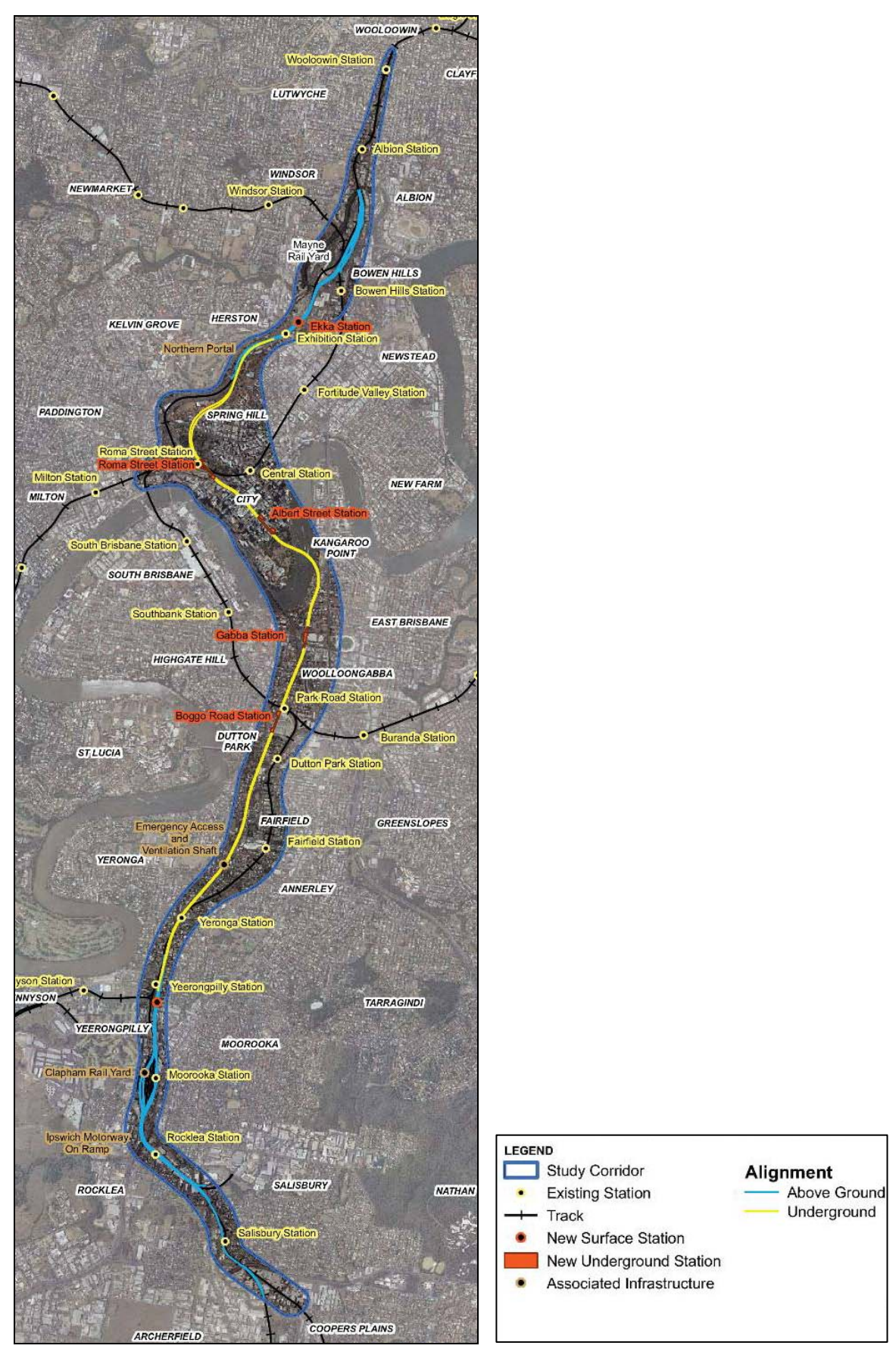
Figure 2.2 CRR study corridor