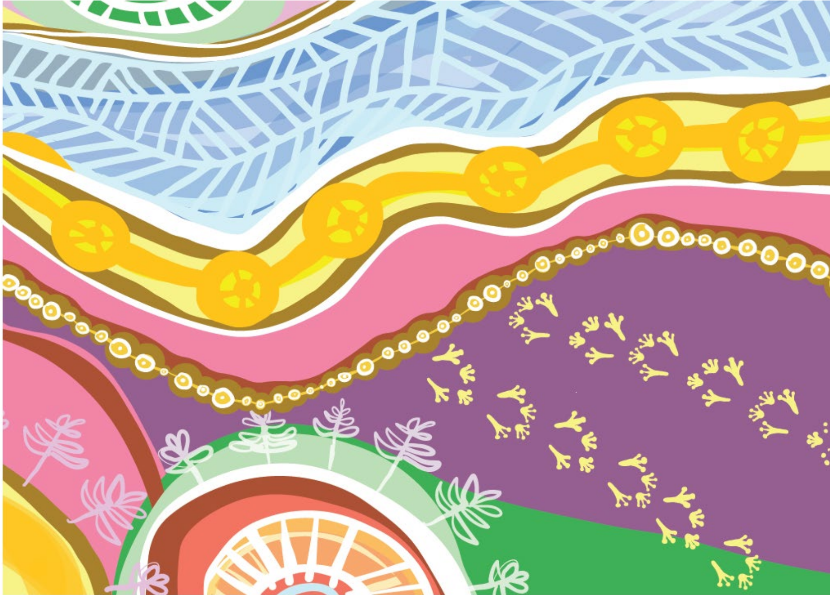
Design for the Yhurri Gurri Framework Department of State Development, Infrastructure, Local Government and Planning