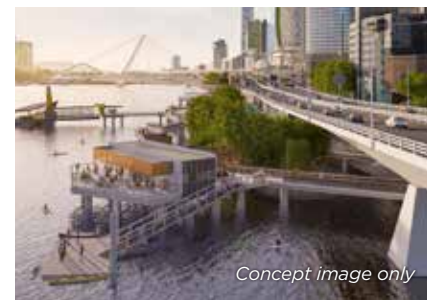
Concept image only

To stay informed about these changes please subscribe to our construction updates and our monthly newsletter by clicking "stay informed" on our project website www.queenswharfbrisbane.com.au .