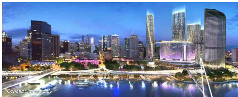
Concept image only

For more information visit www.queenswharfbrisbane.com.au