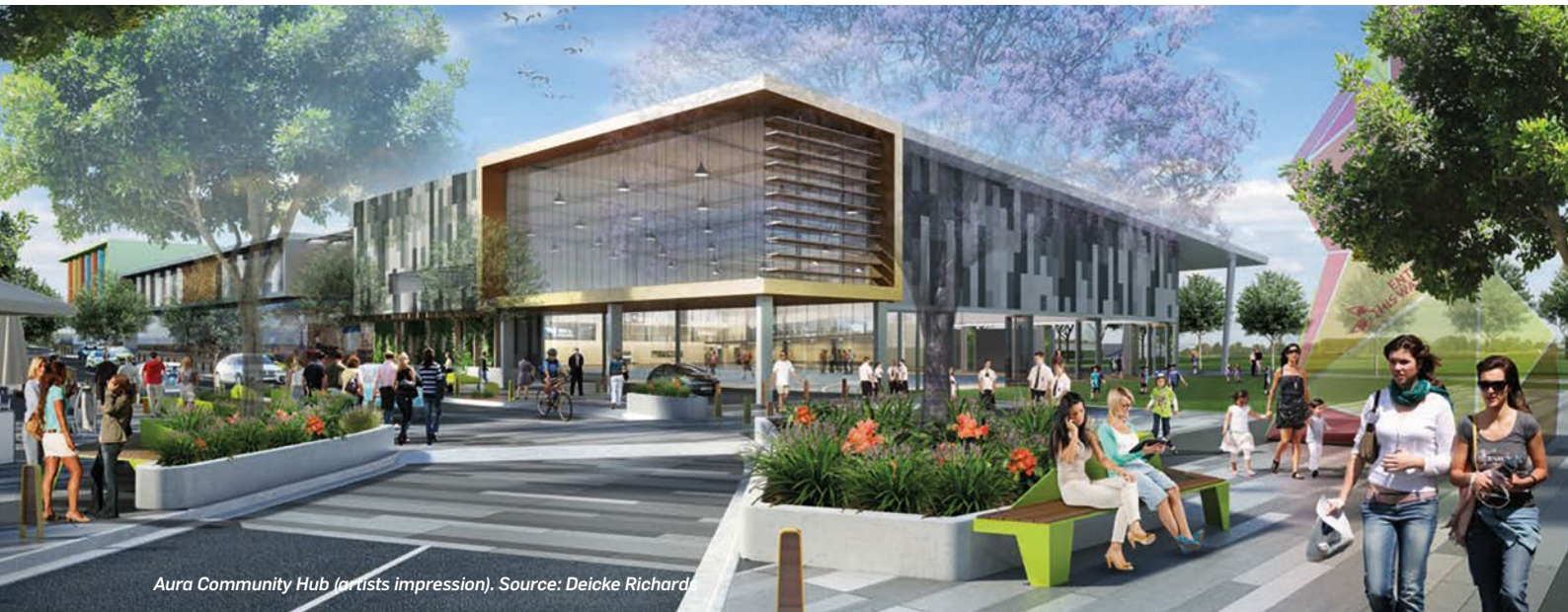
Aura Community Hub (artists impression).