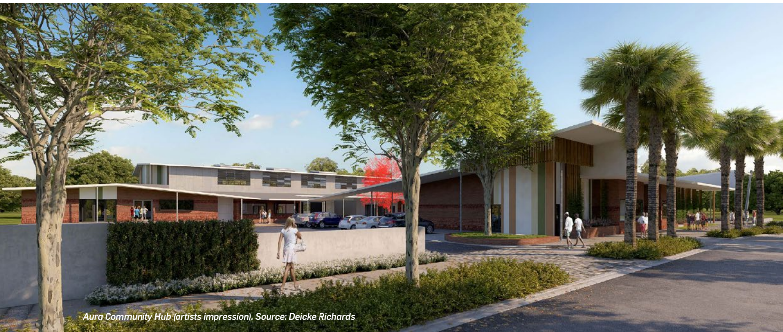
Aura Community Hub (artists impression).