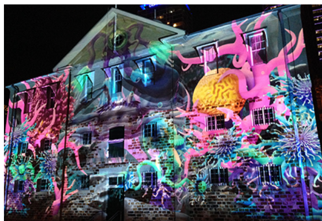
Interactive display on the Commissariat Store Museum