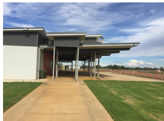
Bulloo Park facilities

“People returning ‘home’ for the event could not believe the progress of the town and in particular the infrastructure such as the new Bulloo Park complex, funded by Building our Regions.”