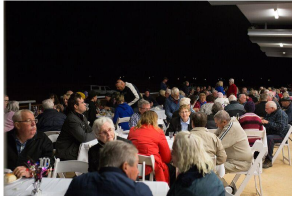
100 and going strong: the crowd at Quilpie's centenary celebrations